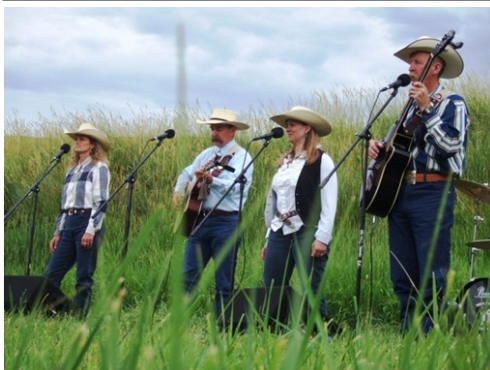
Saddle Strings will provide entertainment during the 3 rd Annual 4-H BBQ Supper & Concert. Saturday, August 27 at 5:30 p.m. at Sandridge Park in Roy.